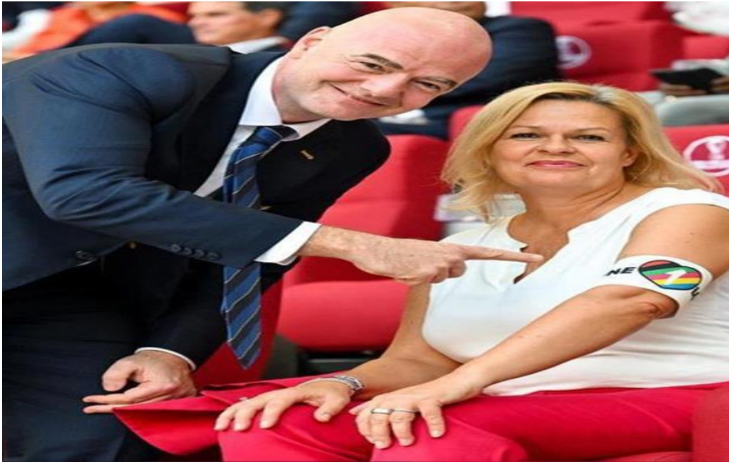
Figure 2. Minister of Interior and the President of FIFA

During the opening ceremony of the 2022 FIFA World Cup in Qatar, the German Minister of Interior, Annette Widmann-Mauz, and the President of FIFA, Gianni Infantino, were present, as shown in Figure 1. Notably, this marked the first time the World Cup was held in the Middle East, a region where LGBTQIA+ rights