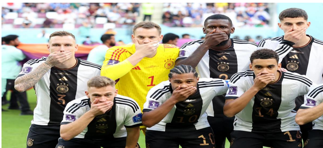
Figure 3. German Football Team

involvement of the RPs in the informal relationships characteristic among friends. The attitude between the viewers and RP is frontal, where slight eye-level with a horizontal angle viewer can experience an increased involvement and equality with the represented participants since the image was taken from a medium close shot. It's worth mentioning that the RP in the image has power over the viewer since the image was taken from below to the top.