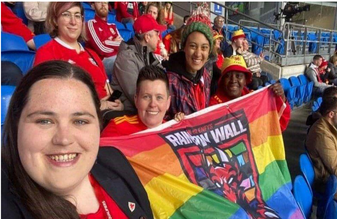
Figure 4. LGBTQ+ Fans

generated some controversy, with some criticizing it as a political statement that was inappropriate for a sporting event. According to the interactive meaning categories like contacts, there is direct eye contact between the RP and the viewers which in turn represents a demand from the German football team to the viewer to engage with them to support the LGBTQ+ community. Similarly, the image represents an intimate social distance since the image was taken from a frontal horizontal angle which indicates the involvement of both the RP and the viewers. The attitude between the viewers and RP is frontal, where slight eye-level with a horizontal angle viewer can experience an increased involvement and equality with the represented participants since the image was taken from a medium close shot. It's worth mentioning that the RP in the image has power over the viewer since the image was taken from below to the top.