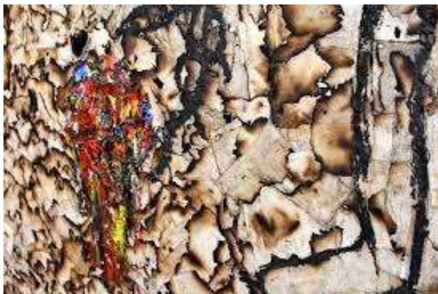
"My Country Map"