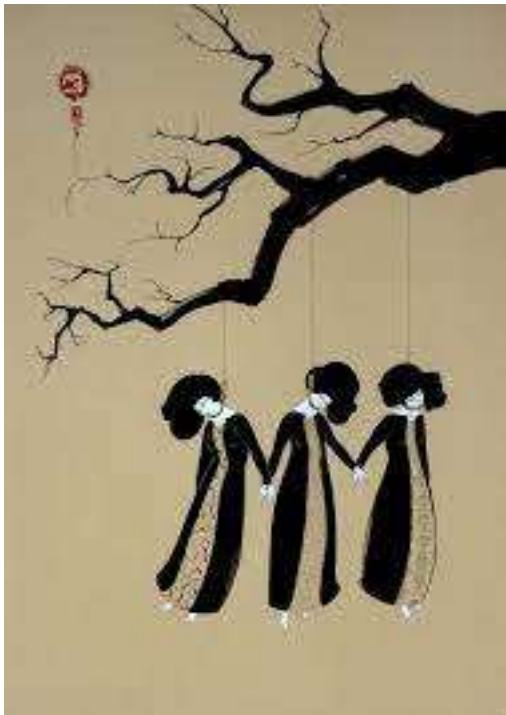
“Three Women Hanging”